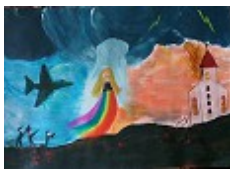
“ALL LIVES MATTER”

Teacher: Sütevaka Humanitarian High School