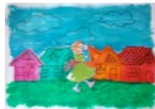
“IN COLORFUL DREAMS...”