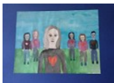
“EVERYBODY HAS A HEART”

Dedicated to promoting peace through arts and culture