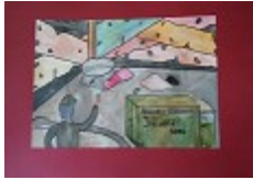
“RESCUERS THAT WERE A LITTLE LATE”

Dedicated to promoting peace through arts and culture