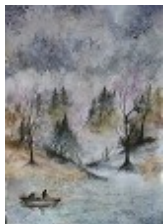
“NATURE AND PEACE”