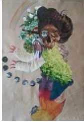
“BIOLOGY OF MYTHICAL AND PECULIAR CREATURES”

Dedicated to promoting peace through arts and culture