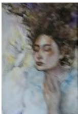
“PEACE IN MY MIND”