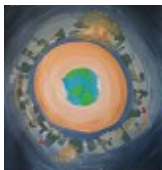
“INSIDE IS PEACE”