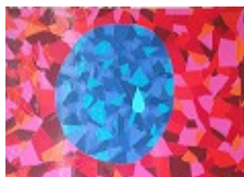
“THE TEAR OF THE EARTH”