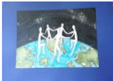
“SPIRITUALLY EQUAL WORLD”