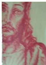
“WE'RE STILL NOT THERE”