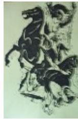
“A WOMAN IS A WOMAN”