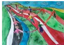
“THE BALTIC CHAIN”